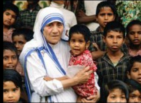
What my mom thinks I do