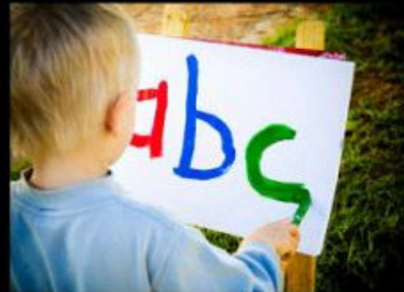
What my boss thinks I do