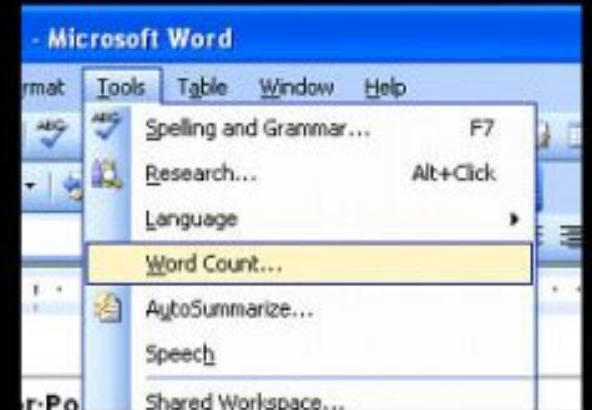
What I really do