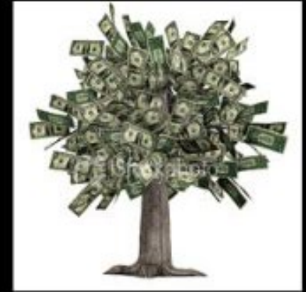
What program staff think I do